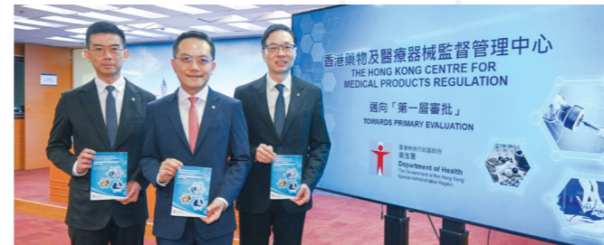
Timetable for Establishing CMPR and Roadmap for Implementing "Primary Evaluation" 「药械监管中心」的成立时间表及推行新药「第一层审批」路线图